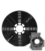
SLATE GREY MP06997