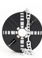
STONE WHITE 375-0008A