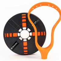
SAFETY ORANGE 375-0009A