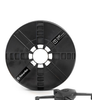
ONYX BLACK 375-0007A